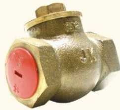
NON RETURN VALVE